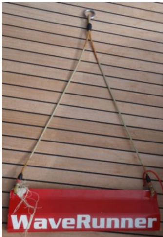
Sling and Spreader

Upon inspection, the steel lifting slings in use were found to have failed in way of the crimped eye connection to the spreader beam. The slings were found to be heavily corroded and this corrosion had not been identified by the onboard maintenance and inspection regime. Further, the history and origin of the lifting sling was not readily apparent. It was stated that they were supplied with the PWC, but the model and manufacturer of the sling could not be identified and no manufacturer's documentation of certification could be located.