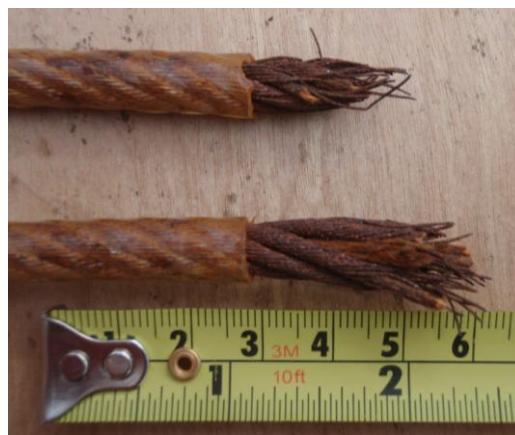
Corrosion of slings